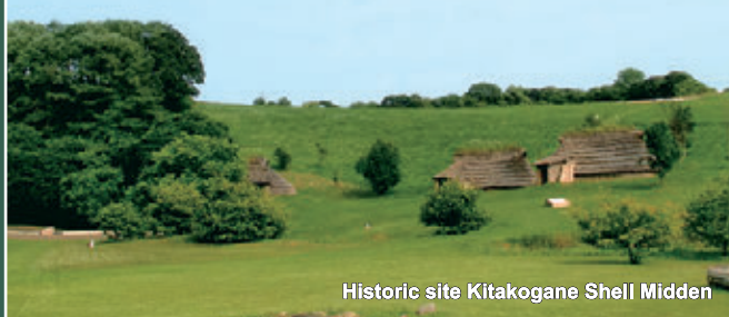
Historic site Kitakogane Shell Midden