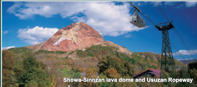
Showa-Sinnzan lava dome and Usuzan Ropeway

The Toya-Usu UNESCO Global Geopark is full of interesting attractions and programs. There are a wide range of topics covering natural, historical and cultural interests as well as geological and volcanological ones.