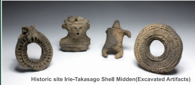
Historic site Irie-Takasago Shell Midden(Excavated Artifacts)