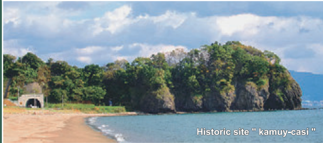
Historic site " kamuy-casi "