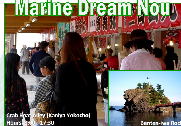
Crab Boat Alley (Kaniya Yokocho) Hours: 8:00 - 17:30