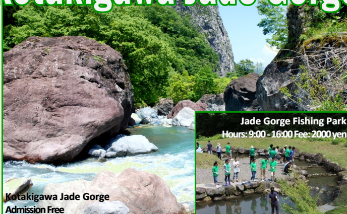
Kotakigawa Jade Gorge Admission Free