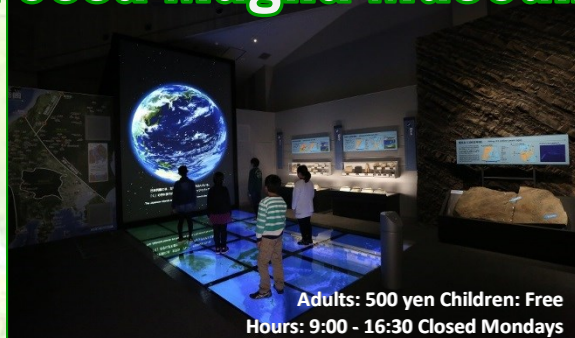
Adults: 500 yen Children: Free Hours: 9:00 - 16:30 Closed Mondays

Newly reopened in 2015, this “ Museum of Jade and the Earth ” features fascinating exhibits about the Birth of the Japanese Islands , Itoigawa UNESCO Global Geopark , and Itoigawa Jade . Discover the beauty and power of Itoigawa, Japan and our planet Earth!