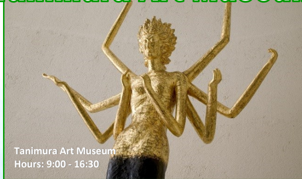
Tanimura Art Museum Hours: 9:00 - 16:30

Designed by famed architect Murano Togo and featuring the Buddhist artwork of Sawada Seiko , this unique art museum is a must-see while in Itoigawa. The adjoining Gyokusuien Garden is a masterpiece of landscaping!