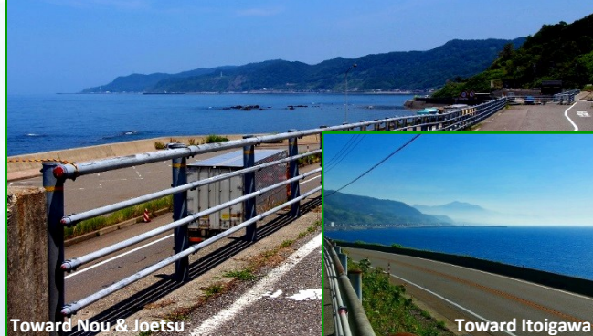
Toward Nou & Joetsu